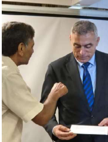
Solidarity message to the Palestinian ambassador, by SUCI(C). October 5

For Israeli rulers, the plan is a windfall. It secures core war aims—Hamas’s disempowerment, hostage