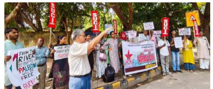
October 7: Delhi