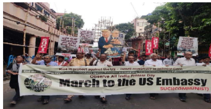
October 7: Kolkata