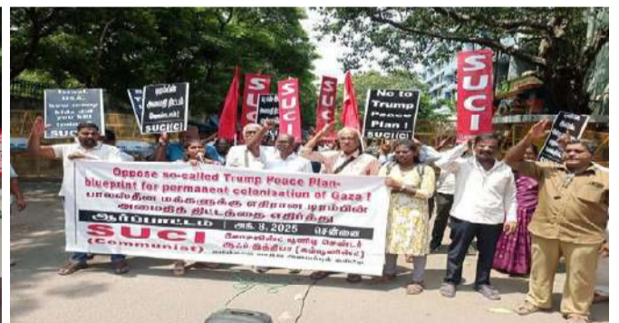
October 7: Chennai