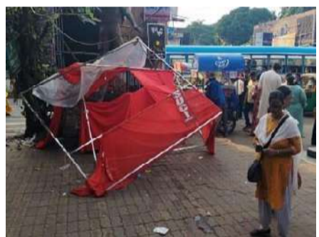
Broken stall at Phulbagan, Kolkata