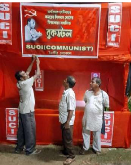
Maipith, West Bengal (Reinstating the stall)

Like previous years, over 1,150 book stalls were set up in various districts of West Bengal during the festive season. The response was overwhelming with massive sale of Party literatures including Comrade Shibdas Ghosh's works, books